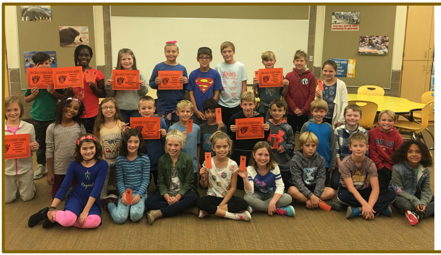
Bear Buck Winners! Top Left - 3rd Grade Below - 2nd Grade Bottom Left - 4th Grade Bottom Right - 5th Grade