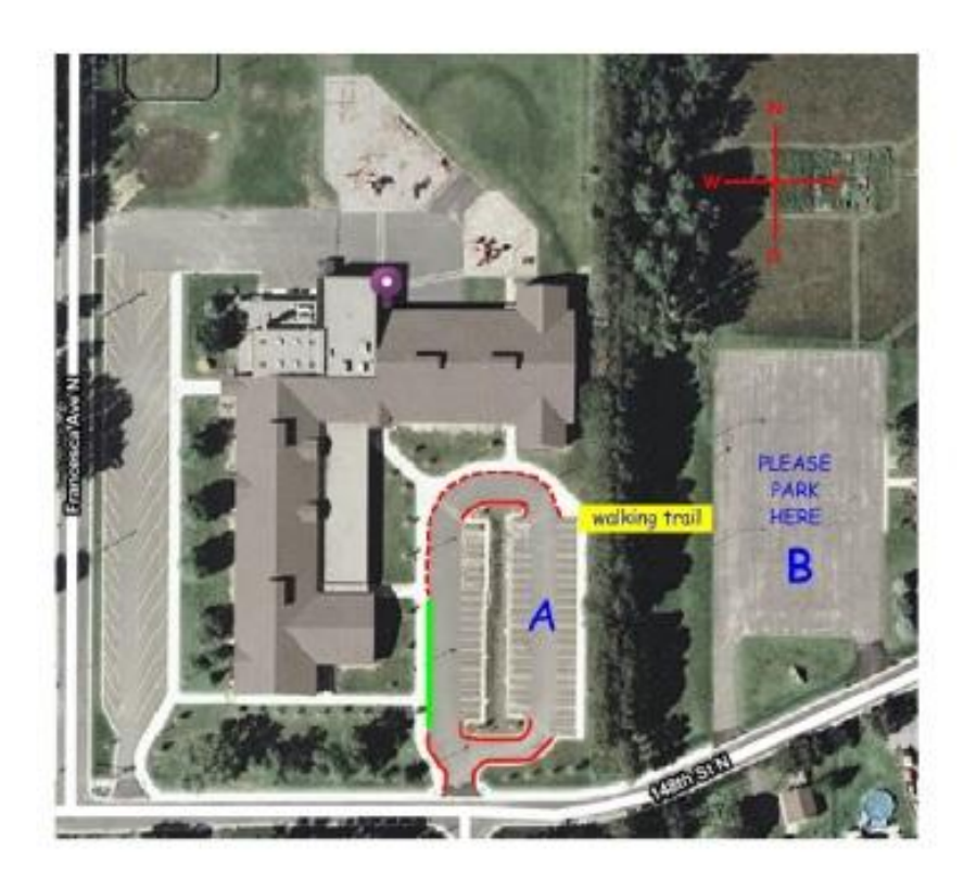
Hugo Before/After School Parking & Pick-Up Procedures

As we prepare for the school year for our PreK-1 students we thought this would be a great opportunity to remind everyone now about the parking procedures we have established at Hugo (Grades K-1). <u>Following these procedures will help ensure the safety of our students at Hugo Elementary and will reduce the likelihood of an accident in the lot.</u>